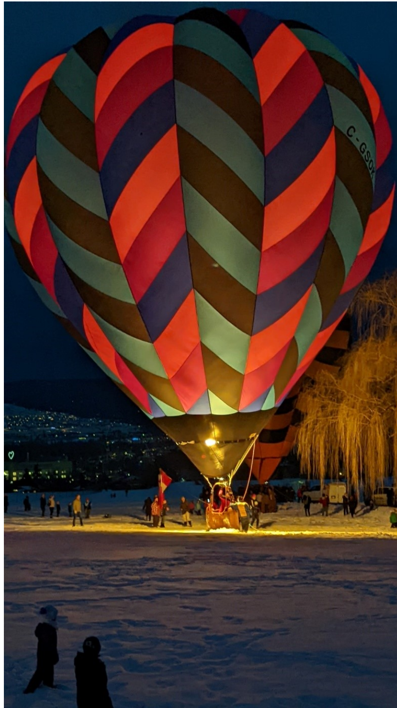
Balloon Glow Vernon Winter Carnival February 4, 2022