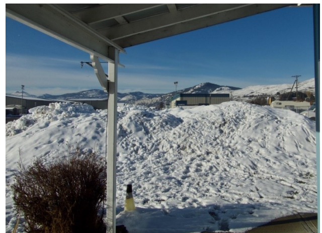
Snow pile outside the clubhouse