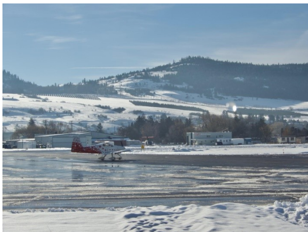
Franz Fux on an icy ramp

We had snow aplenty this winter and kudos to the Vernon Airport Staff for the excellent job they have done keeping the ramps, taxiways and runway clean.