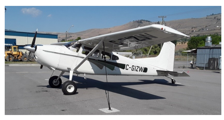
Cessna 180K out of Langley, BC