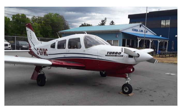
Piper PA-28R-201T Okotoks, AB