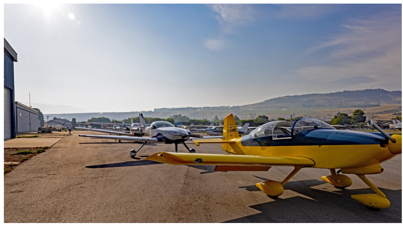
All lined up and ready to go for Discover Aviation on July 15, 2023