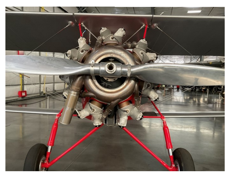
I don't know what plane this is but I thought this engine was fascinating!