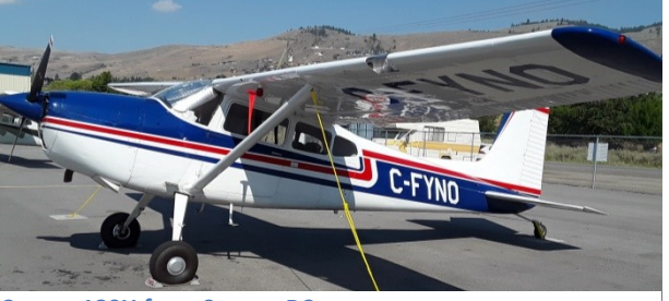
Cessna 180H from Surrey, BC