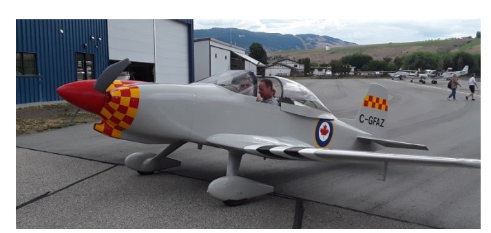
Bushby Mustang II Oliver, BC