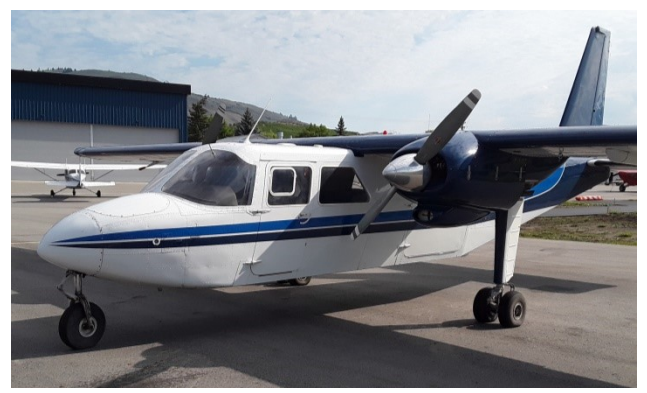
1973 Britten-Norman BN.2A-27, Islander C-GHRK Great River Aviation, Whitehorse, YT