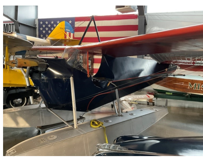
1931 Aeronca C3 on Edo floats