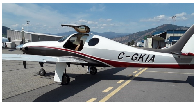
Lancair Evolution from Sherwood Park, AB