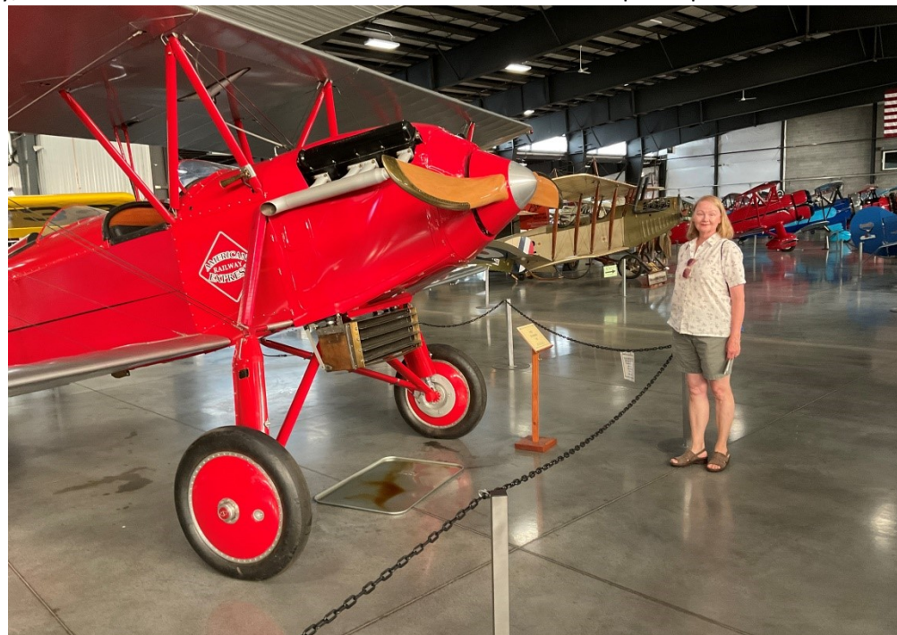
1929 Travel Air 4D

1600 Air Museum Rd. Hood River, OR 97031