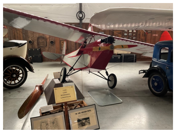
1930 Long Henderson Longster III with Long Harlequin Motor