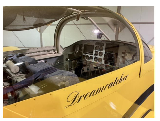
Just 250 hours TTSN Well built by a retired Engineer Hangared for all but its first few months