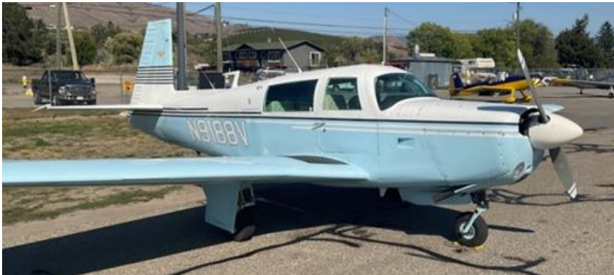
Mooney M20P N9187V