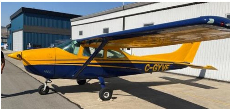
(didn't register) C-182Q C-GYVF Williams Lake