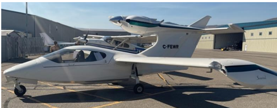
2009 Seawind 3000 (For Sale) C-FEWR Vernon, BC Ted Malewski