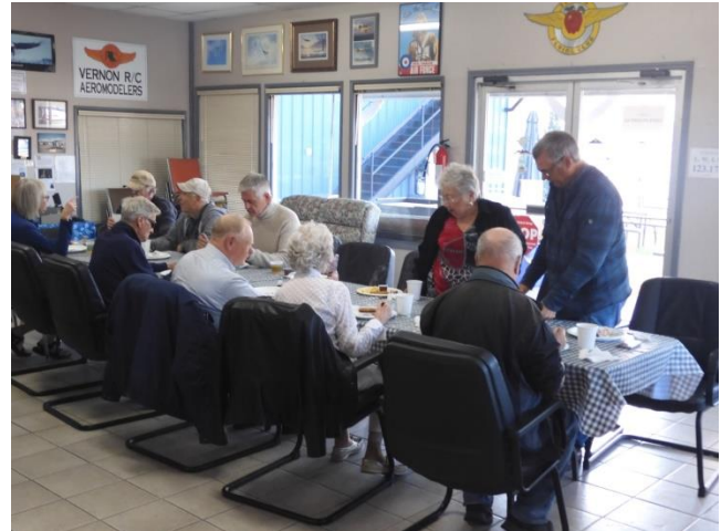
Breakfast, the most important meal of the day!