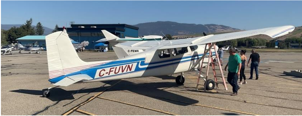
Cessna 180A C-FUVN