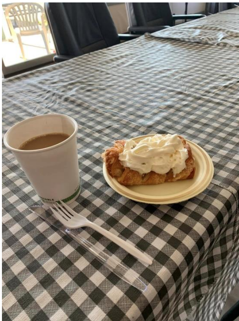
Apple strudel and a coffee (for only $5.00) was a big hit!