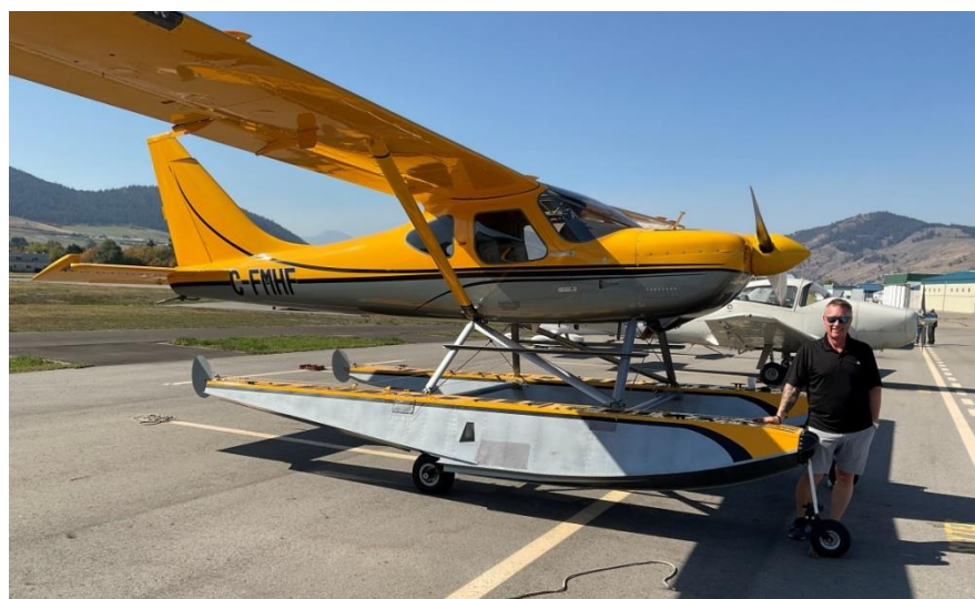
Glasair Sportsman C-FMHF Mabel Lake, BC Maile Friesen